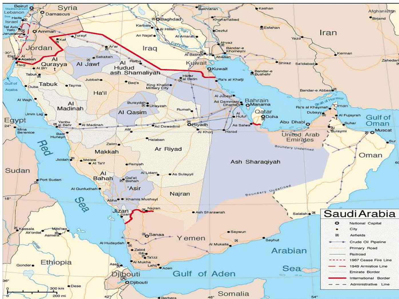
Figure 1. Map of the study area (Tabuk region) from Saudi Arabia.

for their traditional application to treat skin diseases. The number of plants species collected from Tabuk region that used to treat skin diseases is higher compared to other related studies. For instance Balaraju et al. (2015) and Erhenhi et al. (2016) reported only 21 plant species and Egharevba and Ikhatue (2008) reported 41 and Manish et al. (2012) reported 23 plant species which are used to treat skin diseases. In the present study, the life form of herbs was the most dominant and constitutes almost 45% followed by shrubs 29%. This is in agreement with the study of Egharevba and Ikhatue (2008) which reported 42% herbs and 26% shrubs, while it is not in agreement with the study of Erhenhi et al. (2016) which reported the life form trees was the most dominant life form followed by herbs.